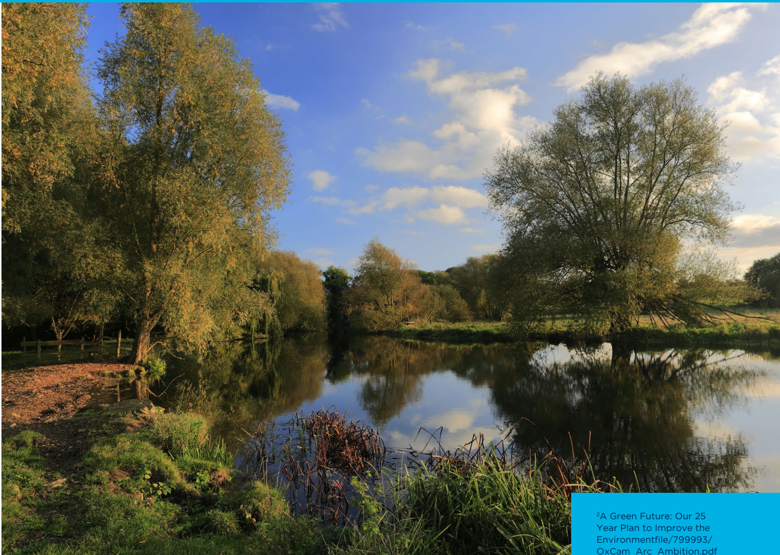
Above Cotswolds Hills Countryside in the area of outstanding natural beauty.

We will also take account of other appropriate government strategies, plans and guidance. Our aim is for the principles to inform and become an integral part of developing plans and statements in relation to the Arc, local plans, local council activities and the plans and activities of activities and delivery programs for all bodies operating in the Arc. It is also our ambition to see universities, private sector developers and third sector organisations adopt these principles.