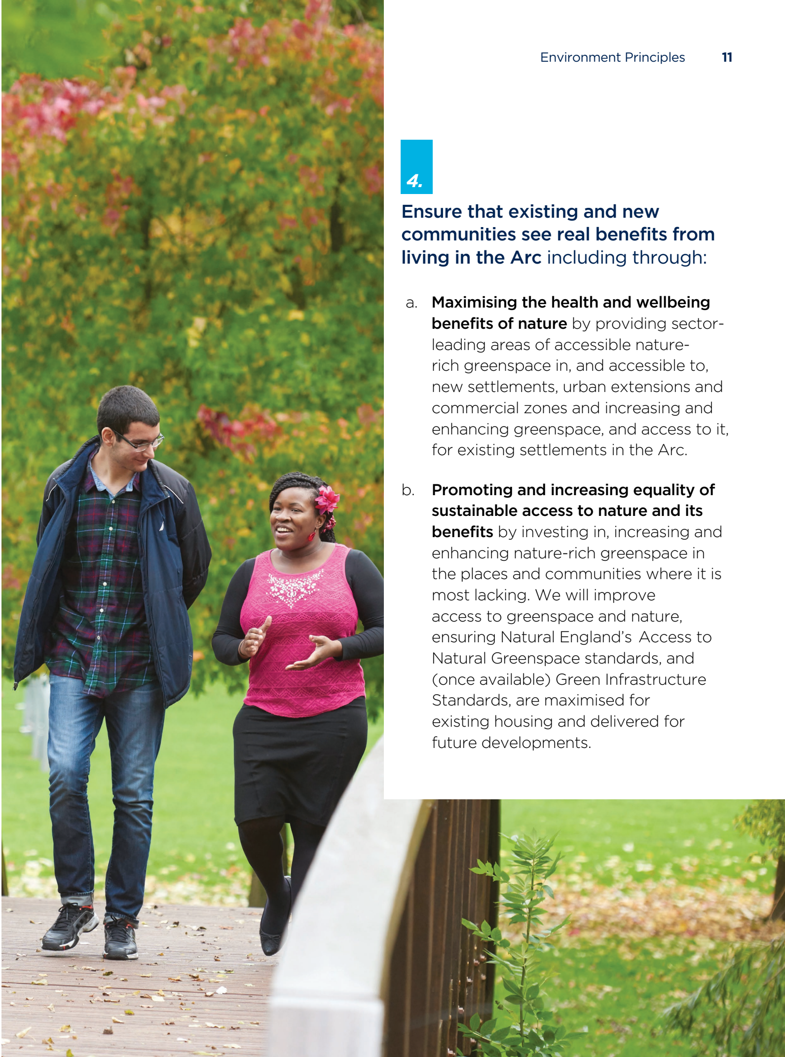
Right People walking in open spaces.