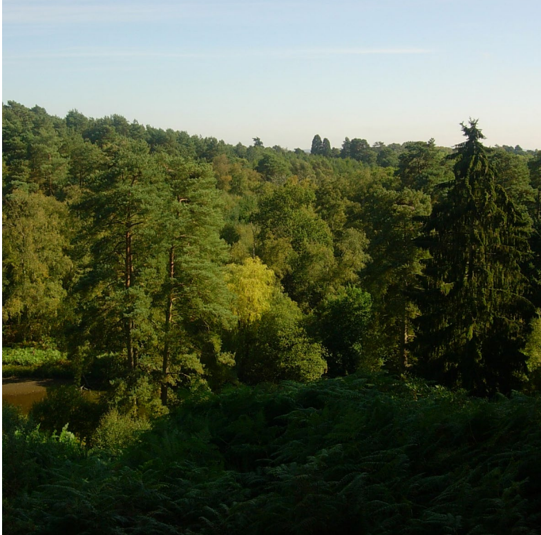
Above Heron Valley, Rushmere Country Park, Leighton Buzzard. Right Punting on the River Nene, Peterborough.